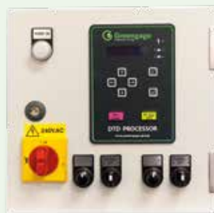
Digital DTD Controller V1.8