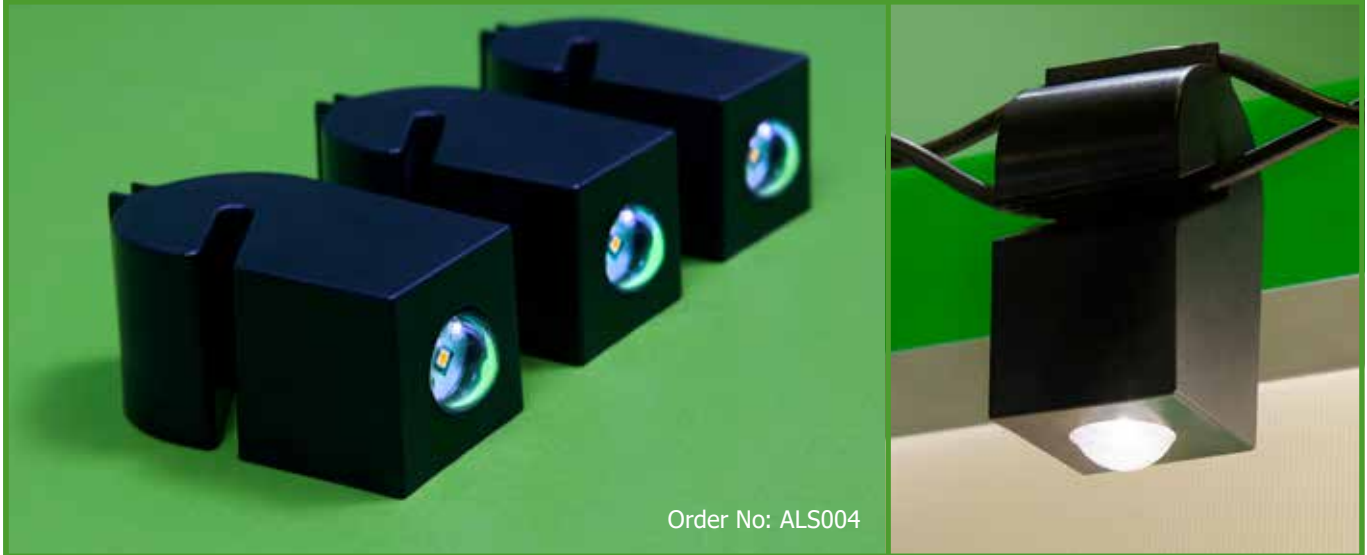
Order No: ALS004