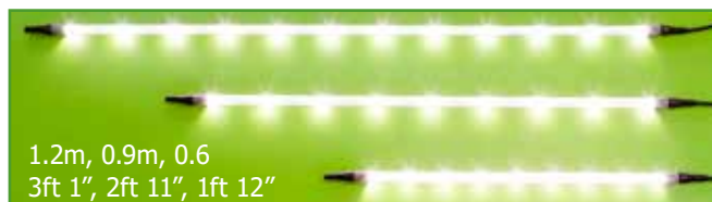
1.2m, 0.9m, 0.6 3ft 1", 2ft 11", 1ft 12"