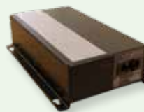
Induction Power Hub 200W 1-Channel (230V) Order No: IPH200230