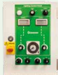
Analogue DTD Controller Model No: ALS0005