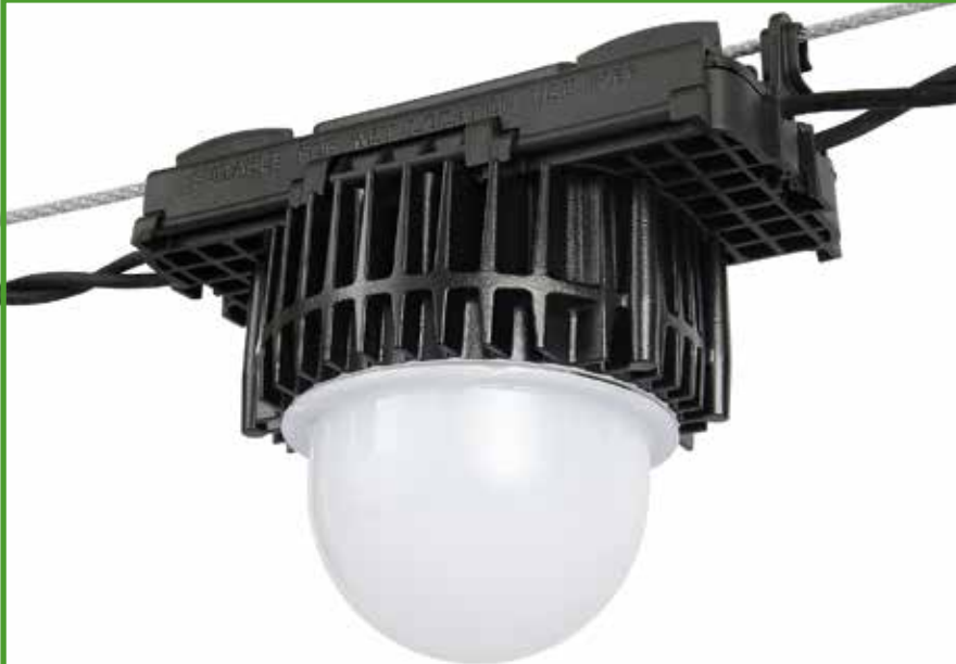
ALIS™ Barn Lamp wide beam (ALS0003)