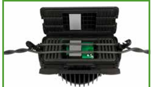
ALIS™ patented inductive power