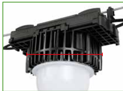
Width (heat sink diameter)