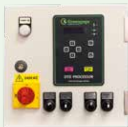
Digital DTD Controller V1.4 Model No: ALS0008 V1.7 Model No: ALS0009