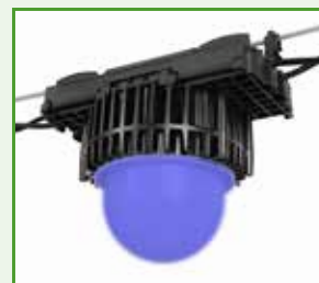
ALIS™ Blue Lamp Model No: ALS0017

ALIS™ Blue Lamp creates calming conditions in poultry sheds for the catching phase.