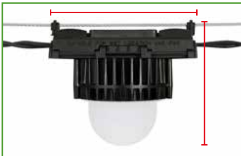
Length and depth