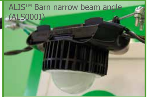
ALIS™ Barn narrow beam angle (ALS0001)