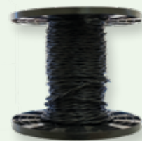
ALIS™ Cable Order No: IPCB