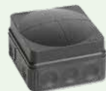
ALIS™ Wiska Box Order No: IP66BOX

NL V4 • Specifications can be subject to change.