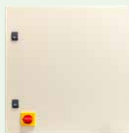
Induction Power Panel 1000W 2-Channel Order No: ALS0006