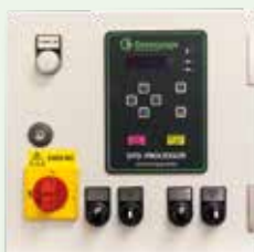
Digital DTD Controller V1.4 Order No: ALS0008 V1.7 Order No: ALS0009