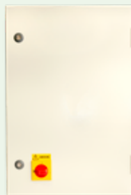
Induction Power Hub 500W 1-Channel Order No: ALS0010