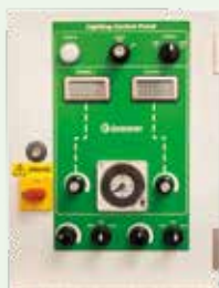
Analogue DTD Controller Order No: ALS0005