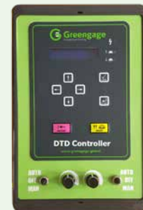
V1.8 Model No: ALS0049