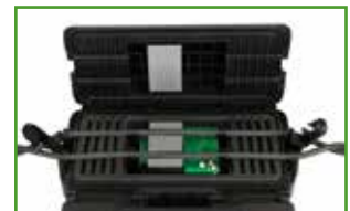
ALIS™ patented inductive power

In comparison to legacy lighting systems, such as CFL and fluorescent, ALIS™ yields energy savings between 50% and 90%.